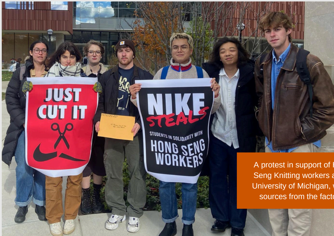
A protest in support of Hong Seng Knitting workers at the University of Michigan, which sources from the factory.