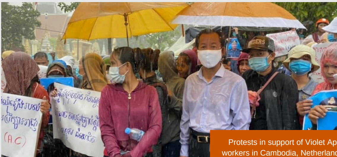
Protests in support of Violet Apparel workers in Cambodia, Netherlands, and Croatia.

Nike continues to evade responsibility for the consequences of their purchasing practices. The Violet Apparel case showcases the advantages they gain through doing business with long chains of subcontractors in a country which has gained attention for failing to protect workers' human rights. But through all the twists and turns, two things are clear: Nike Lies, and 1,284 Cambodian garment workers are still waiting to get paid four years later.