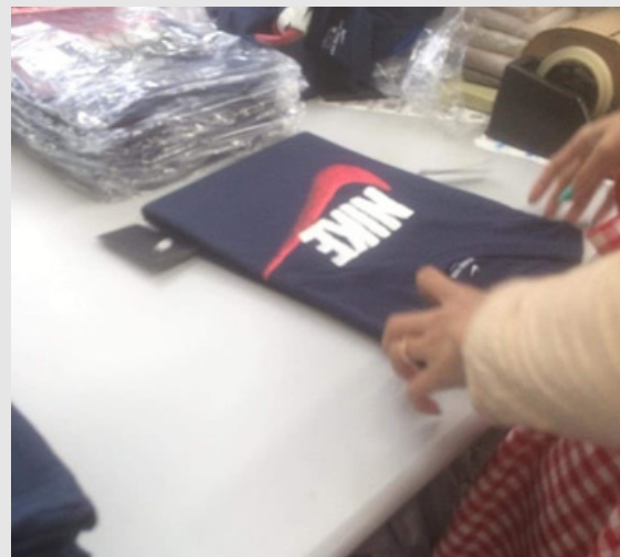
Photos from Violet Apparel taken by workers before the factory closed down, showing Nike products.