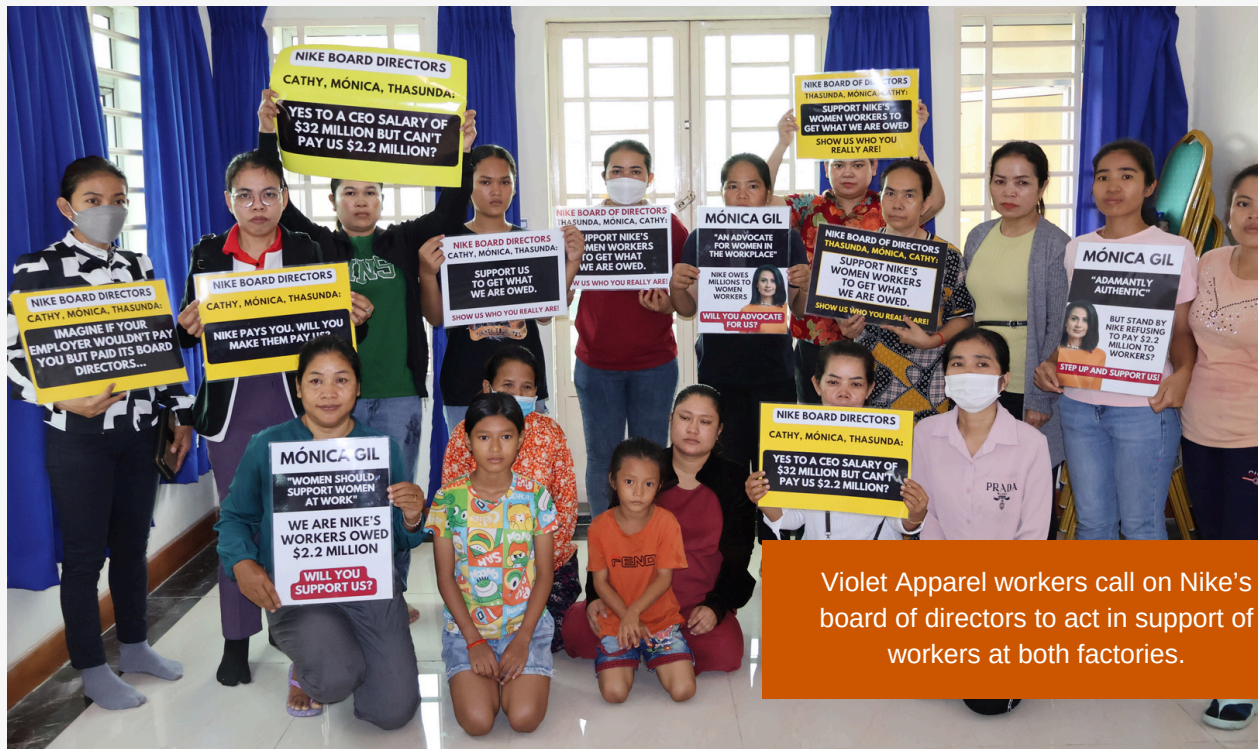
Violet Apparel workers call on Nike's board of directors to act in support of workers at both factories.

Both these case studies make clear that Nike is willing to lie and twist the truth repeatedly. There's just one truth that runs through all these cases: Nike, and the cash-rich factory groups that make its products, put profits and commercial success above everything else, including their responsibility to workers and to international human rights norms.